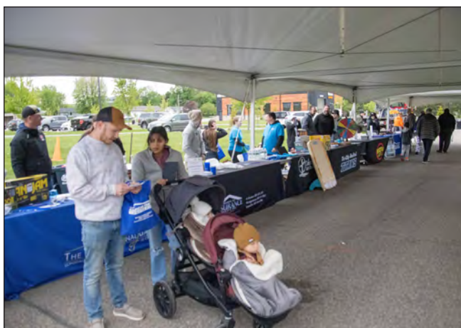
Many partook in the sights and sounds of the Lonsdale Chamber Street Fair & Business Expo.